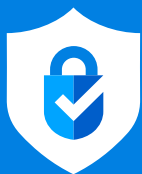
Data Protection & Privacy