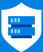
Infrastructure & Network Security

The Intermedia Security Platform provides comprehensive security features that are constantly evolving in order to respond to, and help mitigate, potential threats. The platform capabilities and the technologies it employs are regularly examined and reviewed by the Intermedia security team to help ensure that Intermedia delivers its customers an extremely secure communications and collaboration experience that can be trusted to protect them and their businesses.