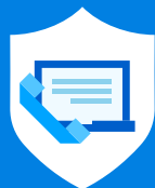
Phones/Devices/ App Security